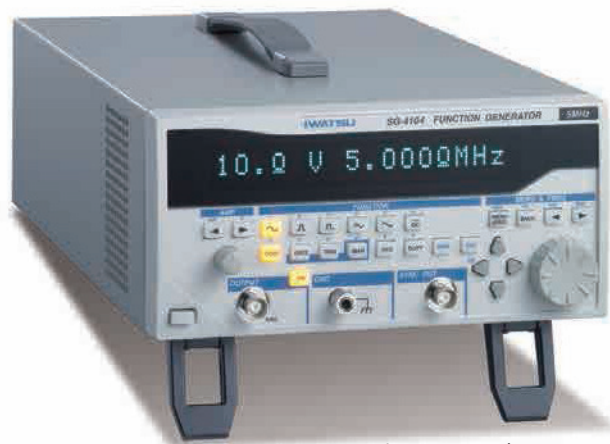
10mHz - 5MHz 1ch SG-4104