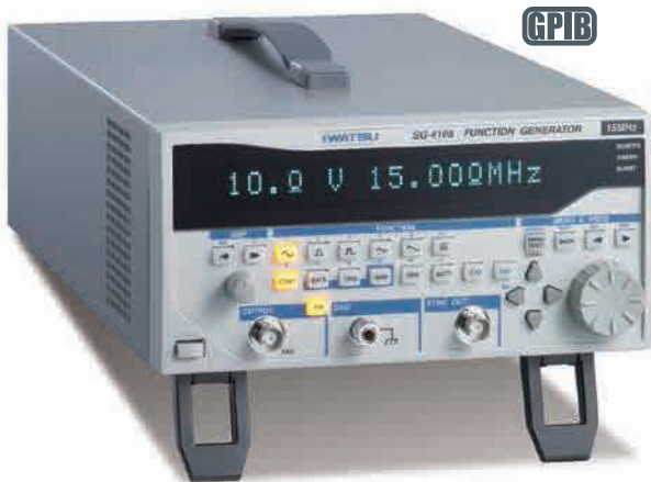
10mHz - 15MHz 1ch SG-4105