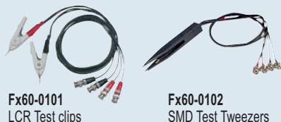
Fx60-0101 LCR Test clips