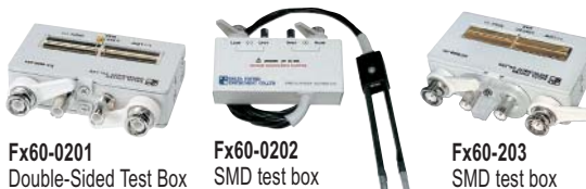
Fx60-0201 Double-Sided Test Box